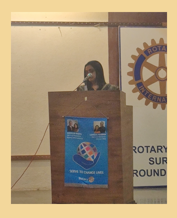
Recitation of the 4 way test